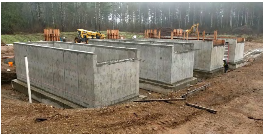
Fig 8 -- The four 17,000-gallon skimmer tanks within the new wet processing facility at Taylor Shellfish were all poured with concrete treated with Xypex Admix to provide a watertight structure that is not only resistant to saltwater corrosion, but also will self heal cracks that may occur in the concrete. Various types of newly harvested shellfish will be stored temporarily in stacked tanks filled with purified saltwater on sloped concrete platforms. The saltwater and any contaminants purged from the shellfish will continually drain into the skimmer tanks.

Admix C-500 becomes a permanent and integral part of the concrete structure and continues to work to prevent the ingress of water and other liquids for the life of the structure. Admix C-500 not only permanently seals the concrete and can heal hairline cracks up to 0.4 mm, it also provides chemical resistance properties that mitigate the attack of chlorides, sulfates and the effects of carbonation and alkali-aggregate reaction.