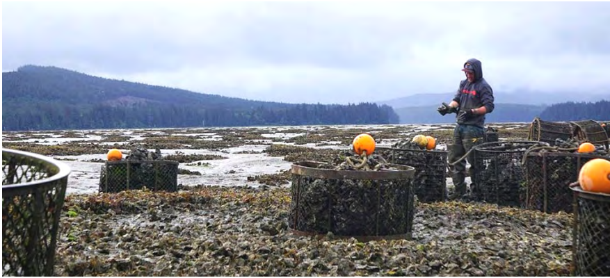
Fig 6 -- Taylor Shellfish owns and farms more than 15,000 acres of tidelands in Washington state and north to British Columbia, Canada. Taylor produces nearly 90% of the shellfish 'seedlings' used by the North American aquaculture industry.

Taylor Shellfish worked with Food Facility Engineering and PSM Engineers to scale their prototype operation up to an 11,000-square-foot facility. Once completed in the spring of 2020, Taylor plans to immediately double the size of the facility by building an identical structure directly adjacent to the current project. The combined 22,000 square feet of innovative new wet processing will enable the firm to clean and ship more than 270,000 pounds of fresh shellfish per week.