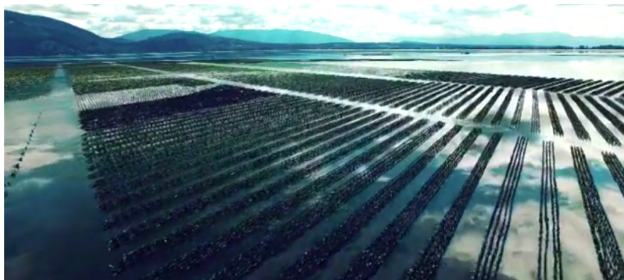
Fig 2 -- Aquaculture is a major industry for Washington state, the only state that allows ownership of tidelands.

Founded in the 1890s, Taylor Shellfish is in its fifth generation of Taylor family management and is the largest shellfish producer of farmed (aquaculture) shellfish in North America (fig 1). The firm employs more than 800 and owns and farms more than 15,000 acres of tidelands (fig 2) in Washington's Puget Sound and up the coast to British Columbia, Canada. It also provides 90% of the North American shellfish industry's 'seed' stock from its hatcheries in California and Hawaii.