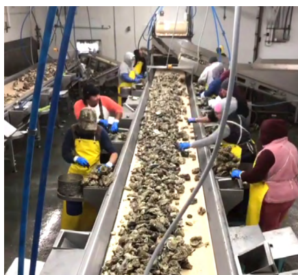
Fig 3 -- A shucking line produces shellfish meat for domestic and export sale.

Taylor operates eight retail restaurants and clam bars (fig 4) in Washington state, China, and South America. The firm supplies about 200 other restaurants in Washington and Oregon, as well as hundreds of others throughout the world via overnight deliveries. Taylor is one of the largest volume shippers in the Northwest, shipping the bulk of its production to Asian markets where it fetches top dollar.