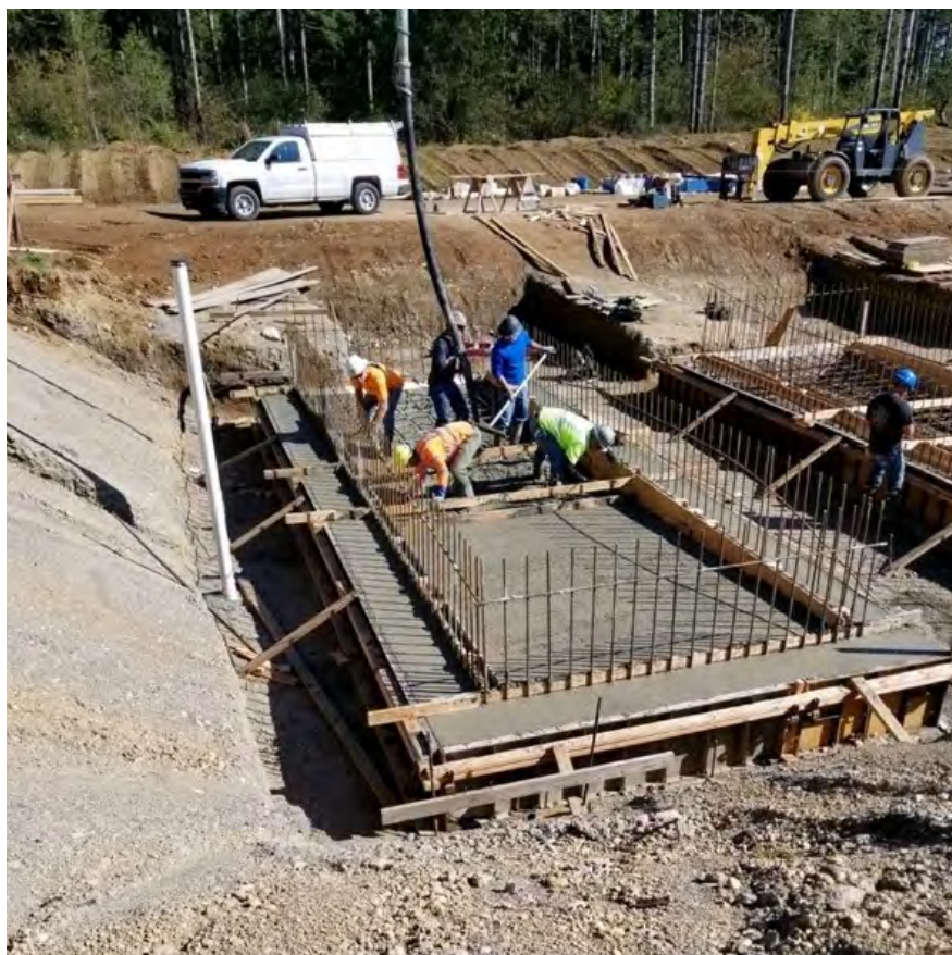
Fig 9 -- Mountain Construction crew members pour concrete treated with Xypex Admix C-500 crystalline waterproofing for the base slabs of four skimmer tanks at the heart of a new wet processing facility at Taylor Shellfish in Shelton, WA.

According to Xypex northwest representative Stephen Keyser, Xypex is often used in applications where concrete will be exposed to potable water or food products. "Xypex products are nontoxic," he notes. "They have been approved by NSF International, US Environmental Protection Agency, Agriculture Canada and many other government health agencies throughout the world for use on concrete structures that hold potable water or are in contact with foodstuffs."