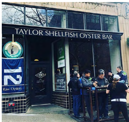
Fig 4 -- Taylor Shellfish distributes its fresh shellfish via eight of its own retail restaurants in the Northwest USA, China and South America. It also supplies hundreds of other restaurants and wholesalers worldwide via overnight deliveries.

Taylor operates eight retail restaurants and clam bars (fig 4) in Washington state, China, and South America. The firm supplies about 200 other restaurants in Washington and Oregon, as well as hundreds of others throughout the world via overnight deliveries. Taylor is one of the largest volume shippers in the Northwest, shipping the bulk of its production to Asian markets where it fetches top dollar.